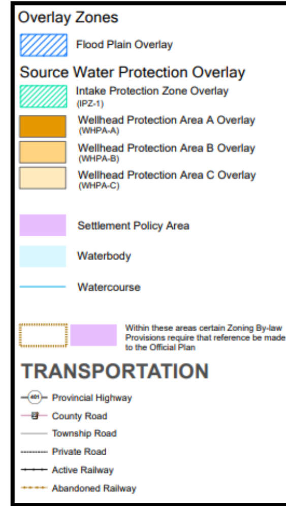
Excerpt of Township Zoning Bylaw - Schedule A