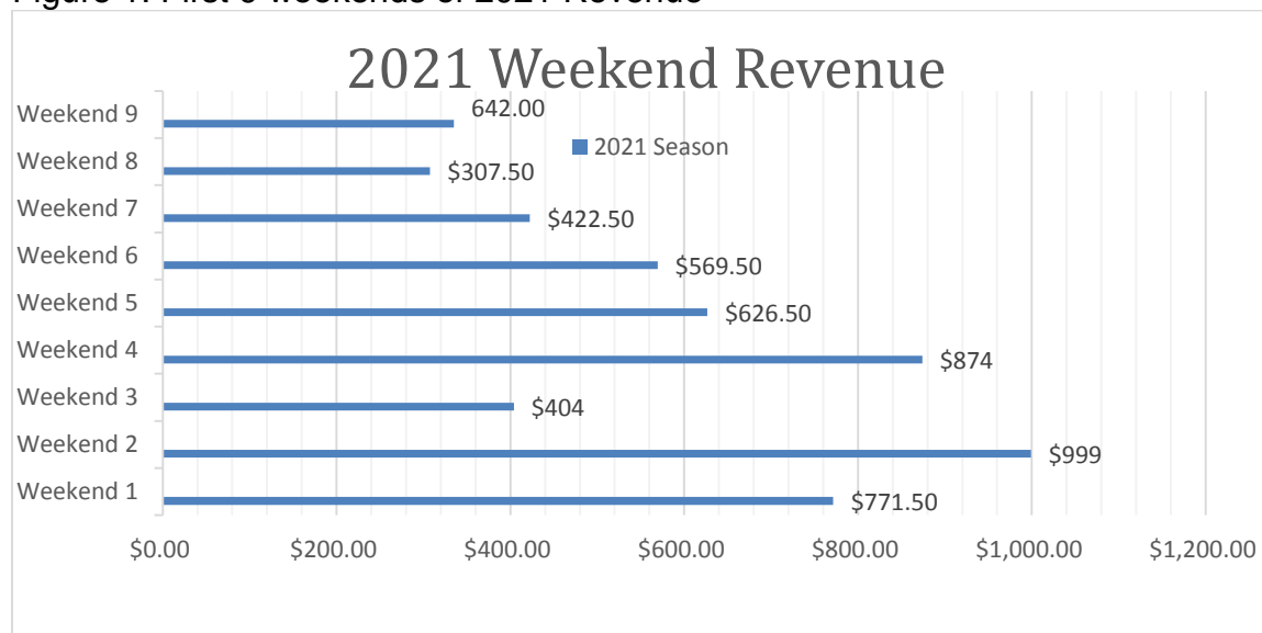
Figure 1: First 9 weekends of 2021 Revenue

See Figure 2 for Percentage Breakdown of Gross Sales in 2020