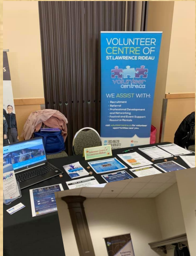
Trade shows & Community Events