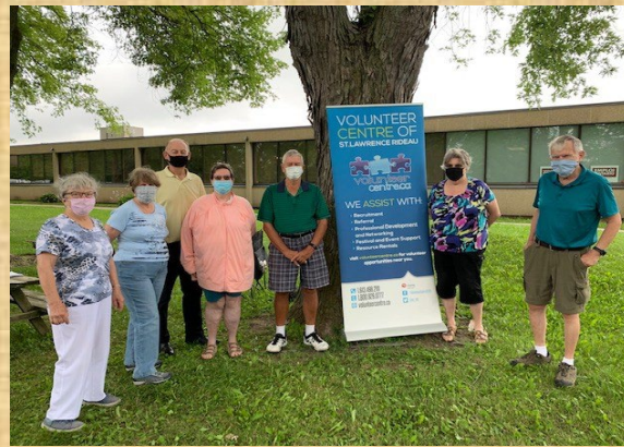
Amazing Community Tax Volunteers