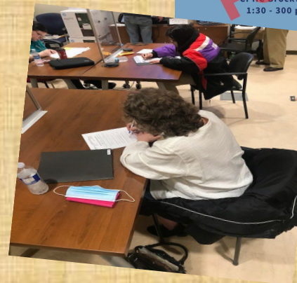
Financial Literacy Workshops