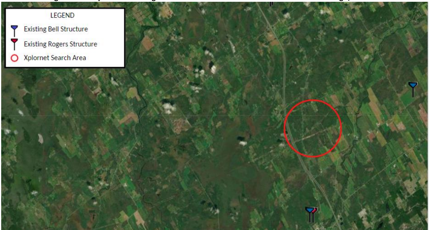
Figure A – Map of the Existing Telecommunications Infrastructure in Edwardsburgh/Cardinal

The area east of Highway 416 is currently underserved