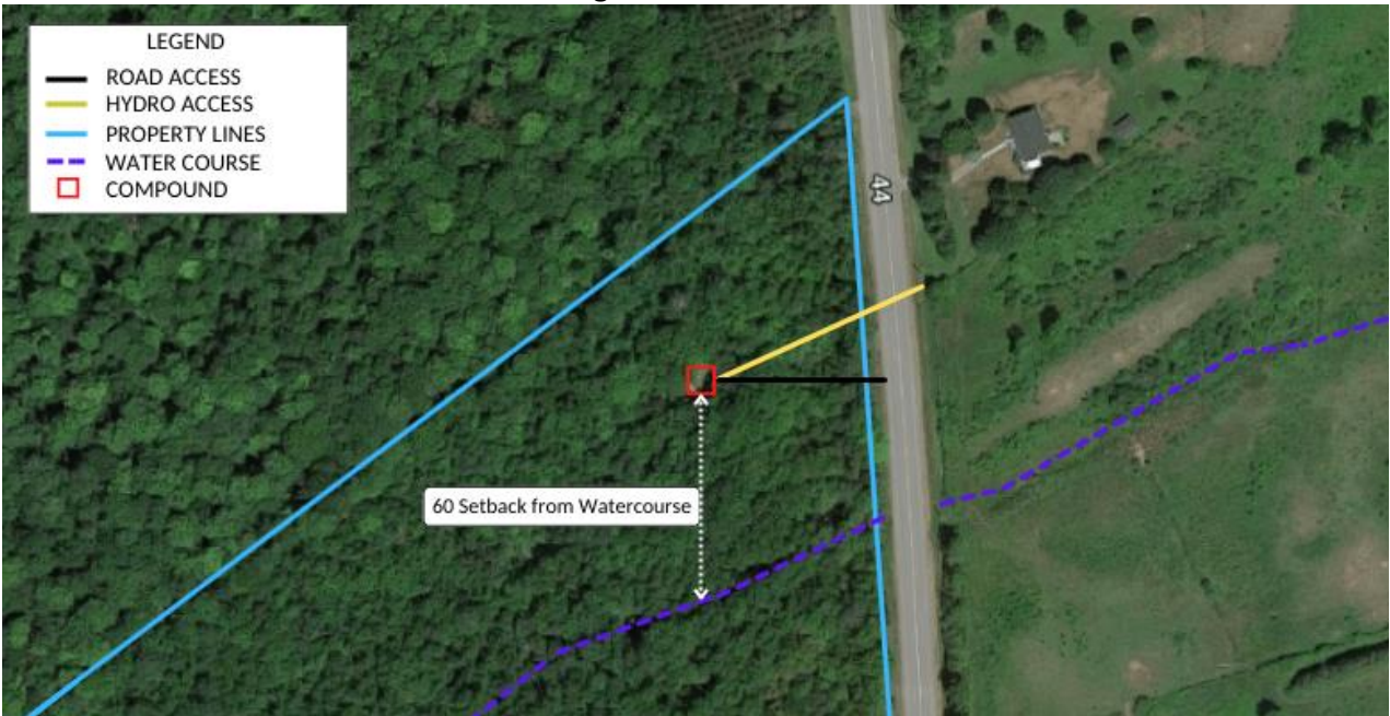
Figure D –Site Plan

The site’s base will be naturally concealed by existing vegetation and is setback from the road