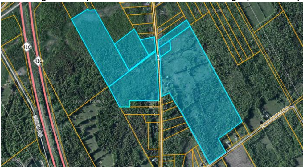
Figure F – Properties Within Three Times Towers Height (135m Radius)

Highlighted properties fall within the radius three times the height of the tower