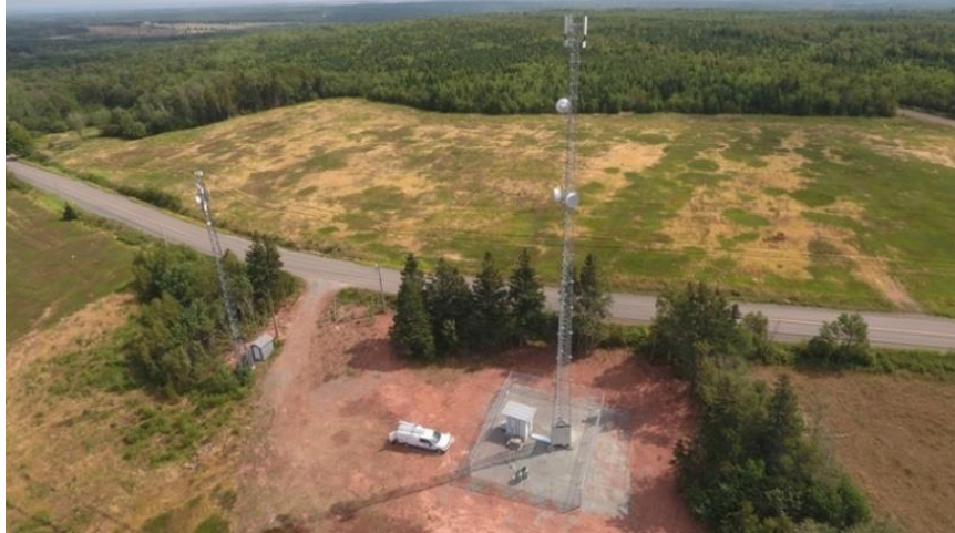
Figure E – Proposed Xplornet 45m Self-Support Telecommunications Tower

Figure E is to be used as reference; some aspects of the design of the tower may vary